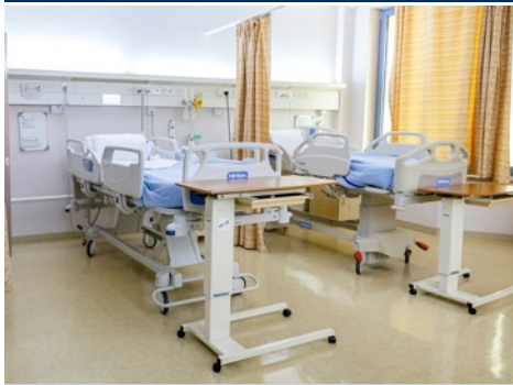
VIP Ward 8 Latifa Hospital