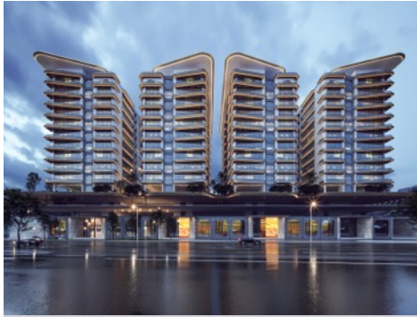
The Hamdan Bin Rashid Cancer Hospital Endowment