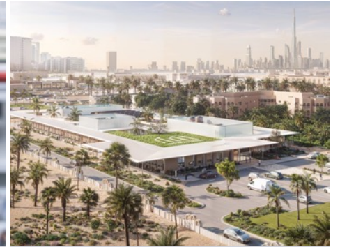
New Diabetes Centre