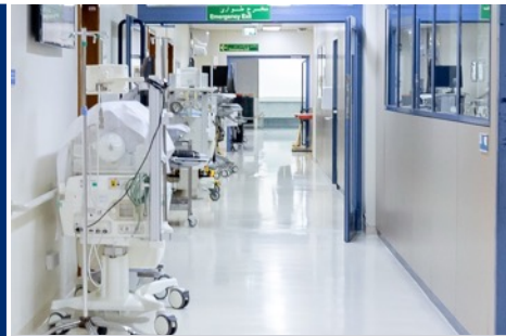
NICU Ward 13 Latifa Hospital