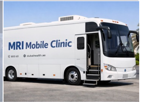
MRI Mobile Clinic