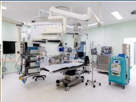
Operating Theatres 3 & 5 Latifa Hospital