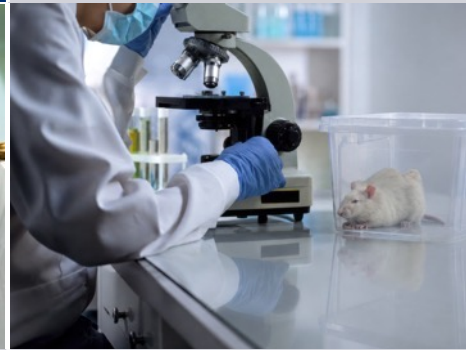
Animal House Lab