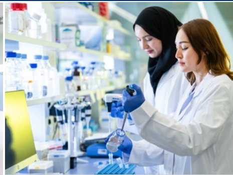
Cancer Research Lab