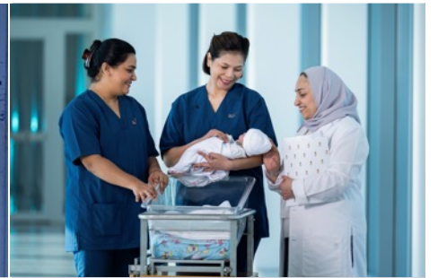
NICU Ward 3 Latifa Hospital