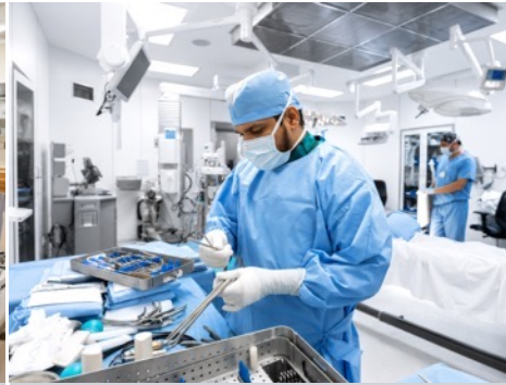
Gastroenterology (Ward 19) Rashid Hospital