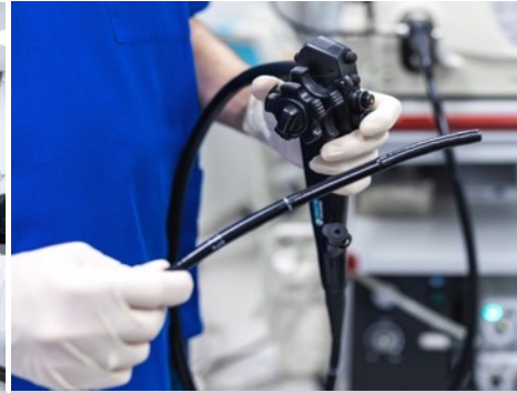
Gastroenterology (Ward 20) Rashid Hospital