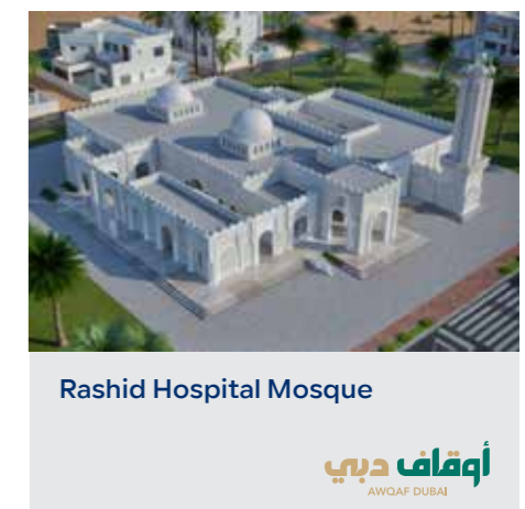
Rashid Hospital Mosque