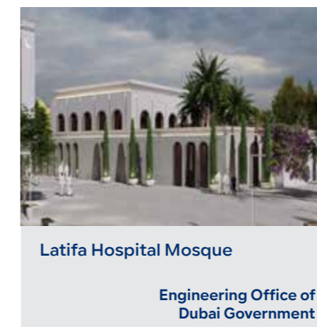
Latifa Hospital Mosque