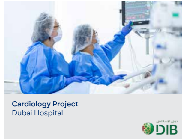
Cardiology Project Dubai Hospital

ALHABTOOR | Late Mohammed Khalifa Al Suwaidi's Fund