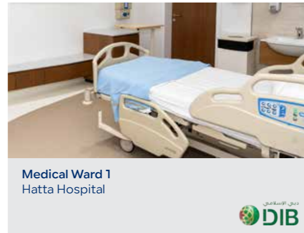
Medical Ward 1 Hatta Hospital