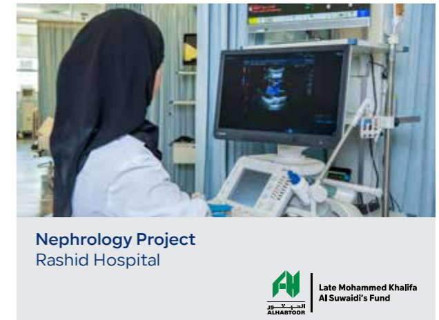
Nephrology Project Rashid Hospital