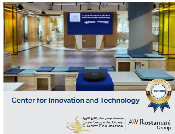
Center for Innovation and Technology

Through every initiative, The Hope Fund reflects a shared commitment to building a healthier future, made possible by the generosity of donors who believe that quality healthcare should be within everyone's reach.