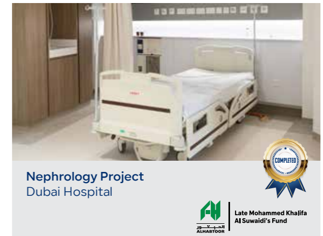
Nephrology Project Dubai Hospital