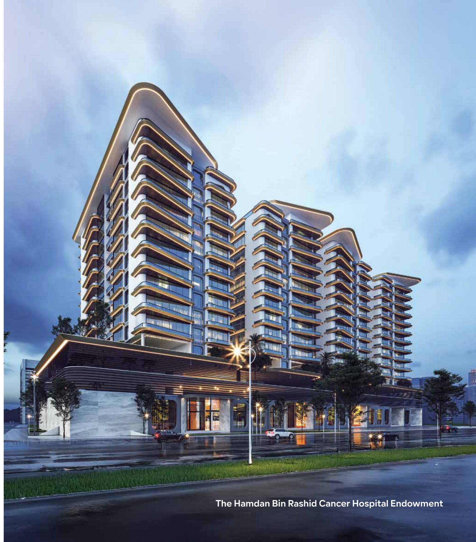
The Hamdan Bin Rashid Cancer Hospital Endowment

These endowments reflect a shared vision of lasting impact, ensuring that generosity today continues to transform lives for generations to come.