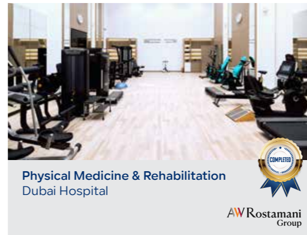
Physical Medicine & Rehabilitation Dubai Hospital

مؤسسة عيسى صالح القرق الخيرية EISA SALEH AL GURG CHARITY FOUNDATION | AWRostamani Group