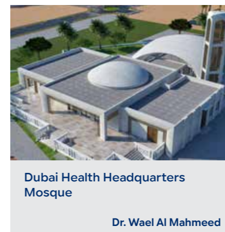
Dubai Health Headquarters Mosque