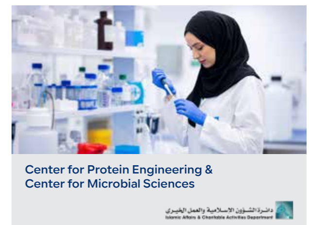
Center for Protein Engineering & Center for Microbial Sciences