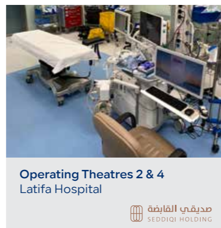
Operating Theatres 2 & 4 Latifa Hospital

دائرة الشؤون الإسلامية والعمل الخيري Islamic Affairs & Charitable Activities Department