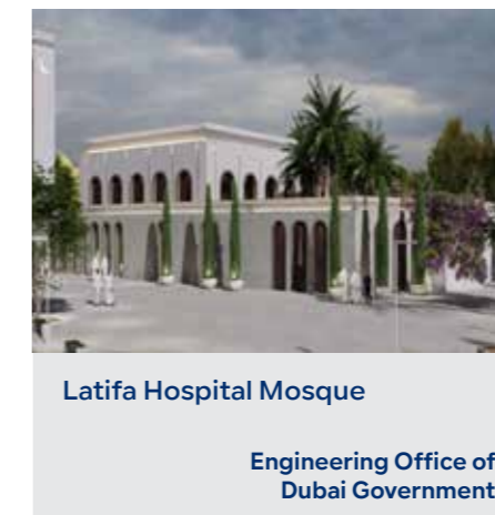
Latifa Hospital Mosque