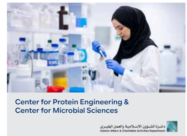
Center for Protein Engineering & Center for Microbial Sciences