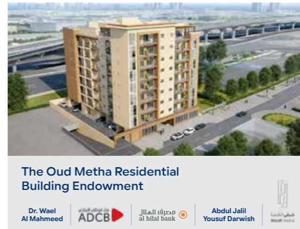
The Oud Metha Residential Building Endowment