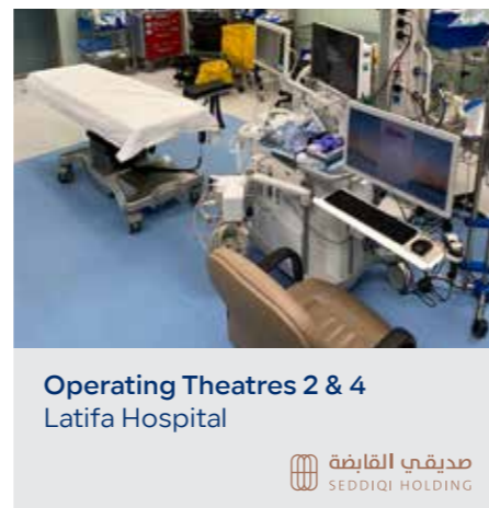
Operating Theatres 2 & 4 Latifa Hospital

دائرة الشؤون الإسلامية والعمل الخيري Islamic Affairs & Charitable Activities Department