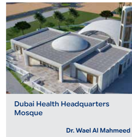
Dubai Health Headquarters Mosque